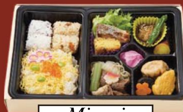
Minori 1200 Yen

Rice: Chirashi sushi, Gomoku gohan, Okowa Main: fried egg, chicken karaage, grilled salmon Variety of fruits and prepared vegetables