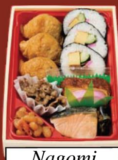
Nagomi 800 Yen

Rice: Gomoku gohan Main: fried egg, fried egg, mixed tempura, grilled salmon Variety of prepared vegetables