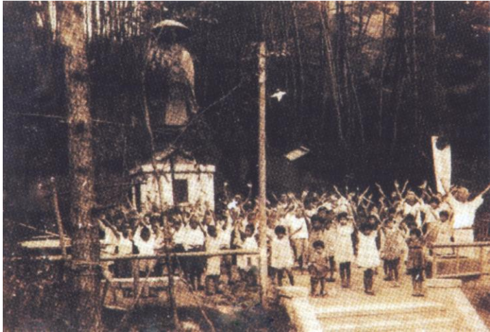
Children doing radio calisthenics in front of the statue on Hijirigaoka hill in 1941