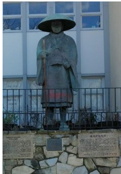
Statue at NY Buddhist Church