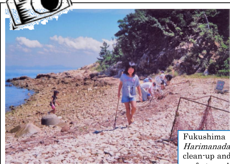
Fukushima children hosted by Save the Harimanada Bay organization, take part in beach clean-up and swimming during homestay in Hyogo prefecture. August