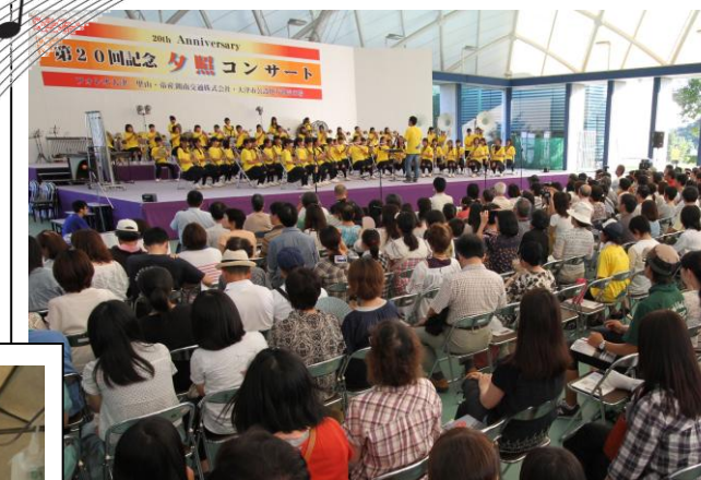
Sekisho Concert and Ishinomaki (Miyagi) handicrafts charity sale at Ryukoku University, Seta campus. August