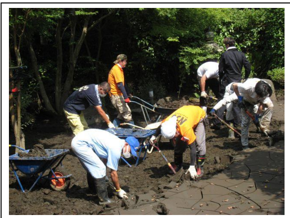
Kumamoto Young Ministers group assisting with clean-up following Northern Kyushu floods. July