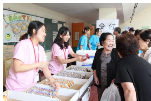
Musashino Women's college students distributing snacks at Arigato Festival (Tsuyama Youth Sports Center, Miyagi). September