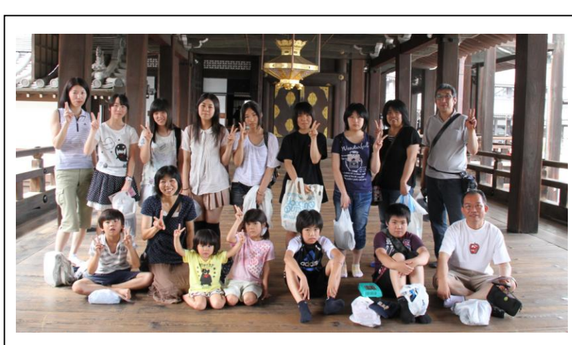
Top: Children and families affected by Fukushima's nuclear crisis participate in summer "temple-stay" in Kumamoto prefecture and also visit Hongwanji. August Left: Memorial service and visitation to former site of Ogawa Elementary School in Ishinomaki (Miyagi). August