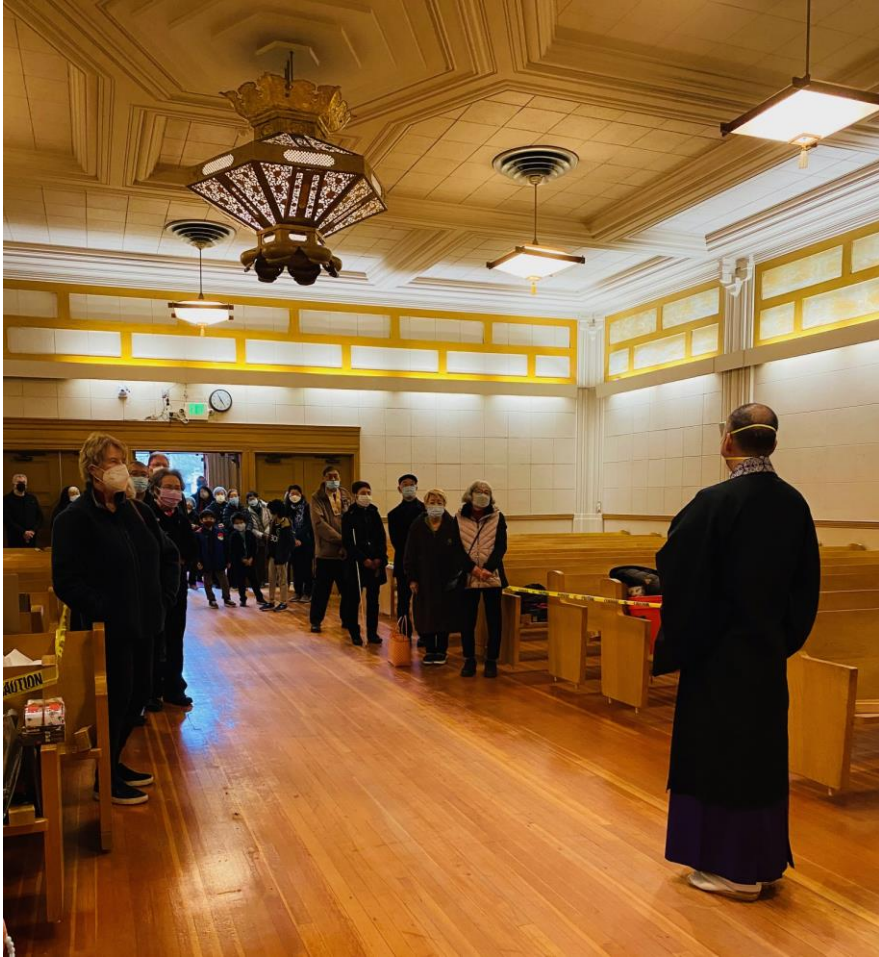
Above: (left) final service before altar adornments shipped to Japan. (right) Shinran Shonin statue from the Memorial Hall. Base was lost in fire. Below: Taiko damaged in fire.