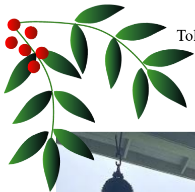
Tolling of the bell at Joya-e (New Year's Eve service)