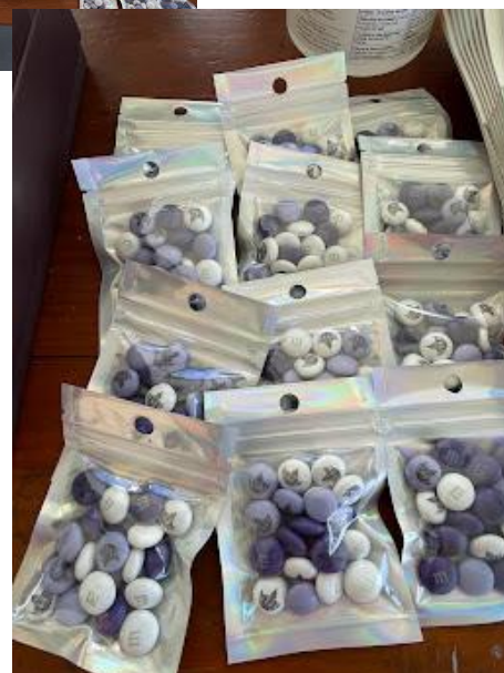
Puna Hongwanji chocolate candy