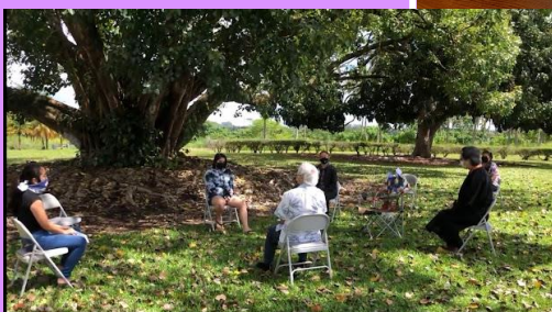
Honoring graduates under the Bodhi Tree