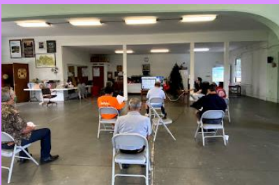
ZOOM general membership meeting

As restrictions were eased, Sunday service and Dharma gatherings slowly returned maintaining social distance to new hybrid styles such as in-person and online.